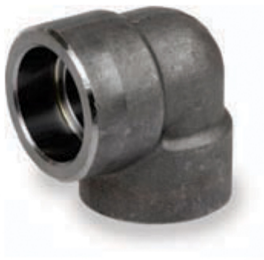
Fig. 52E 3 - 90° Elbow